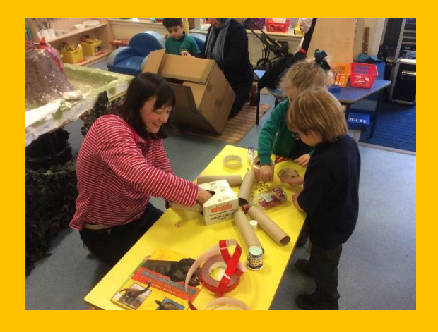
Strong links with parents