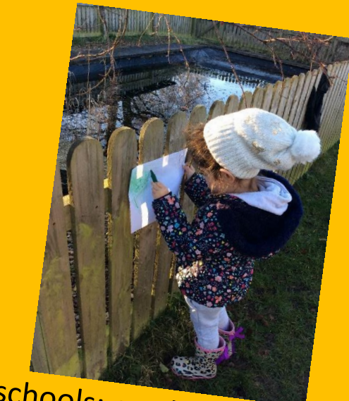
Forest schools: outdoor investigation