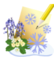
Winter to Spring Poem