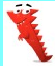
The zig-zag monster