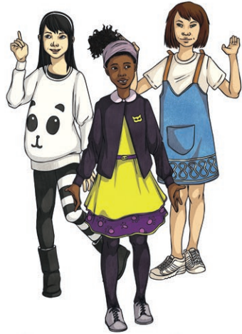
them or they