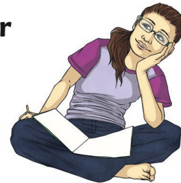
me or mine