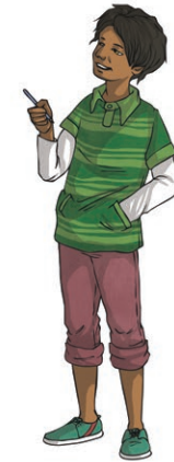
he or him