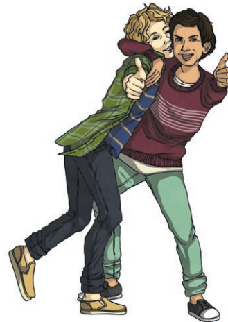
we or us