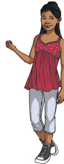
she or her