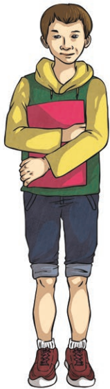
you or yours