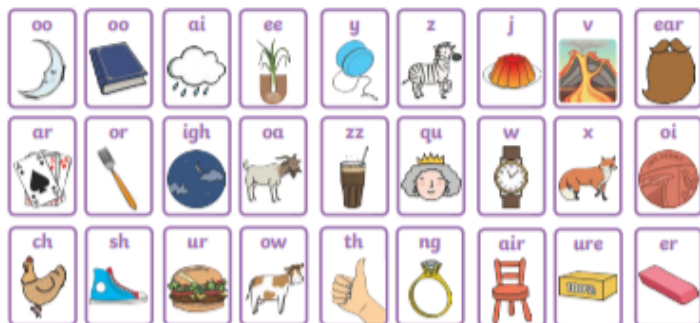
Phase 5 Sound Mat