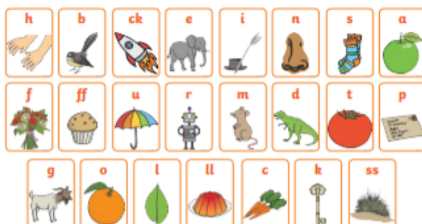
Phase 3 Sound Mat