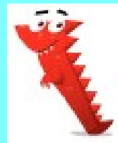
The zig-zag monster