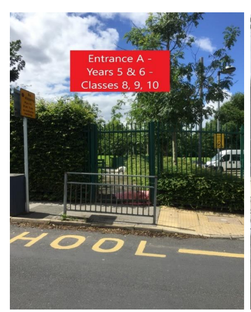
Entrance A - Year 5 & 6 (Classes 8, 9, 10) entrance and exit to school

The entrances and exits will remain the same as they were last academic year.