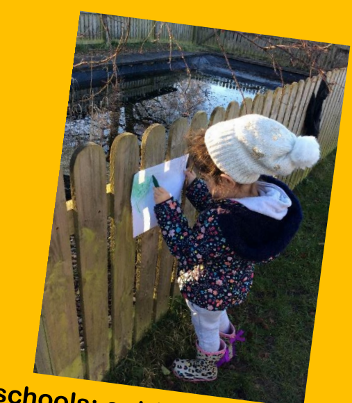
Forest schools: outdoor investigation