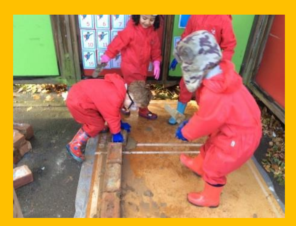
Motivating and inspirational