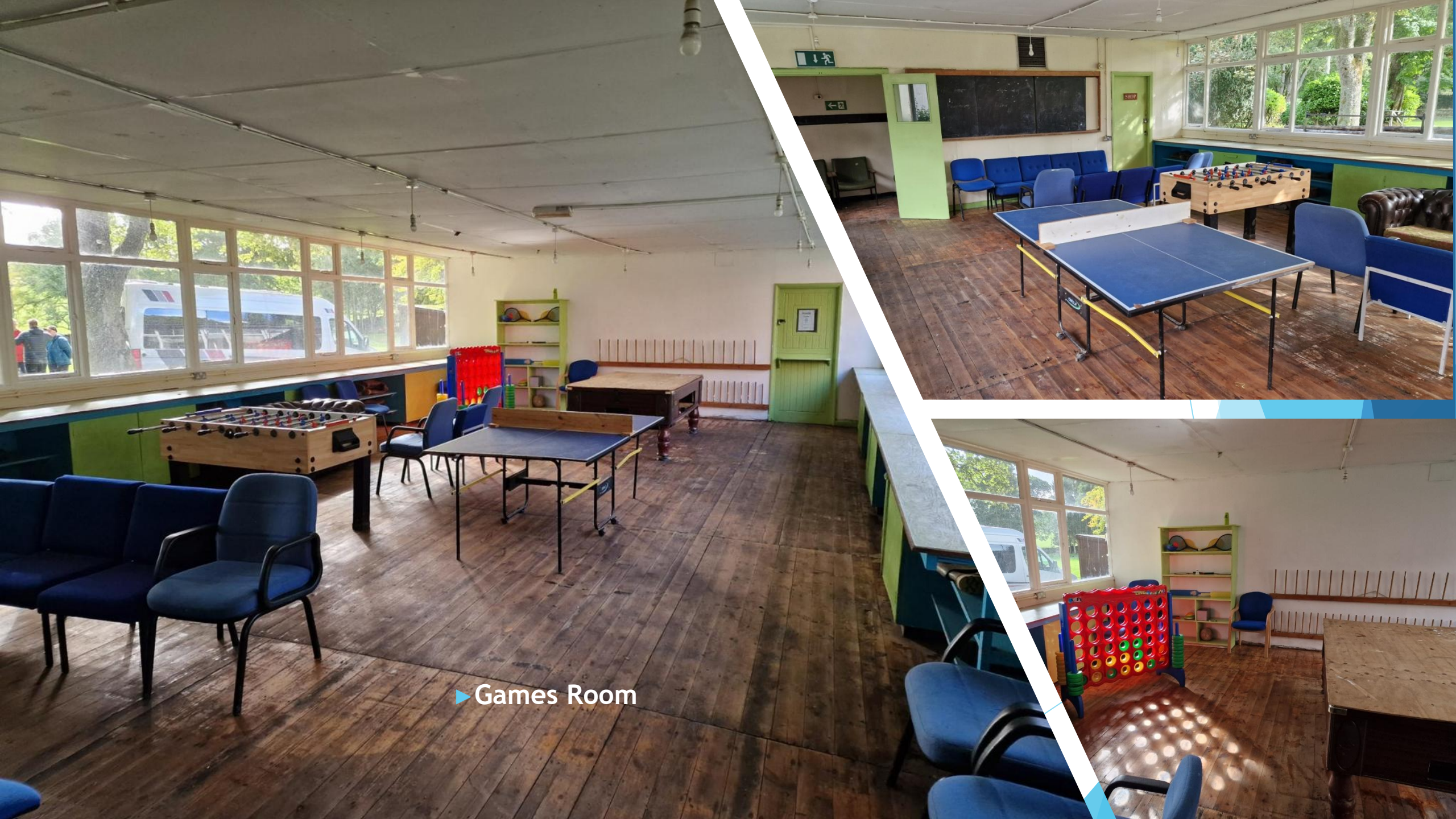
► Games Room