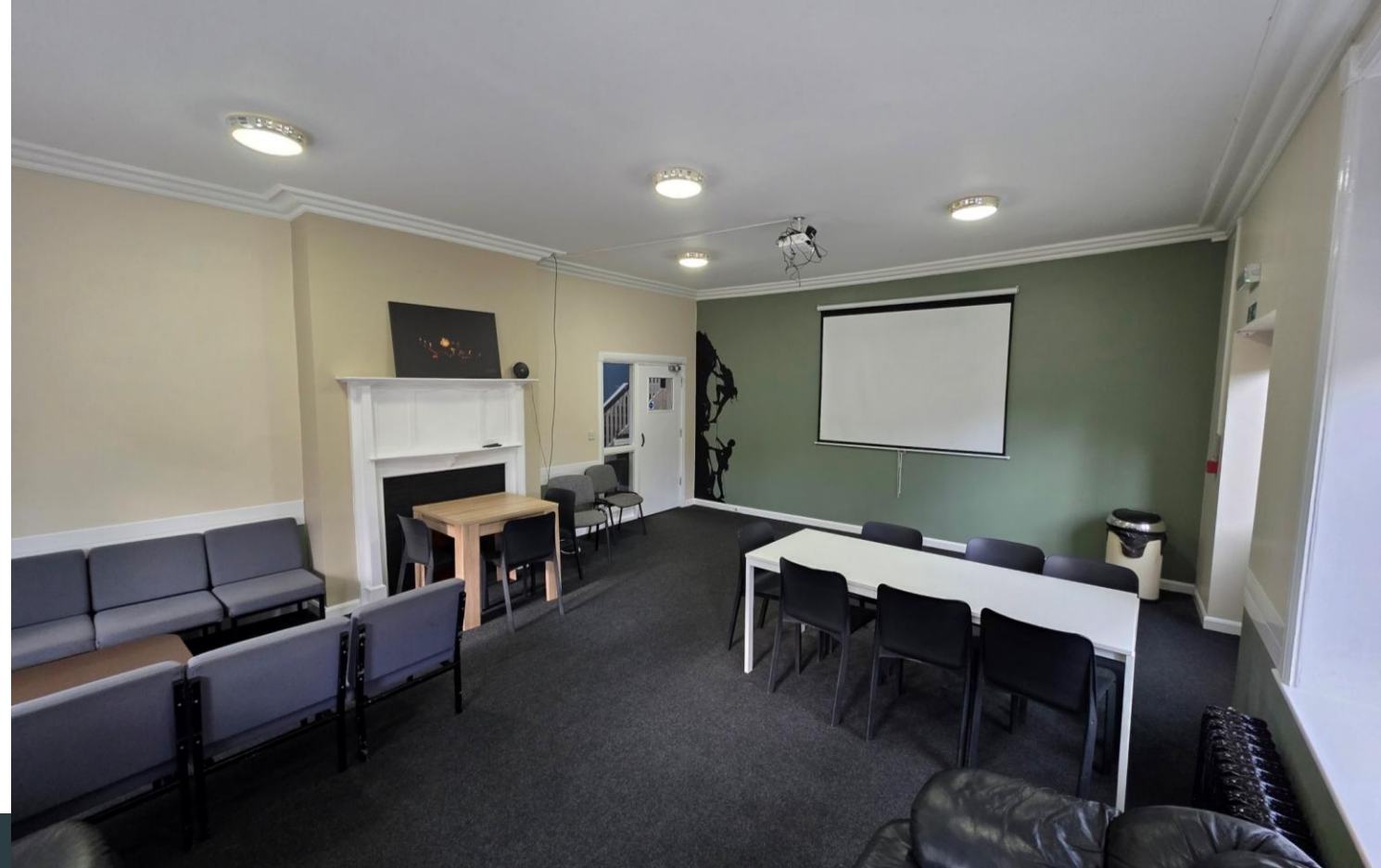
► Common Room