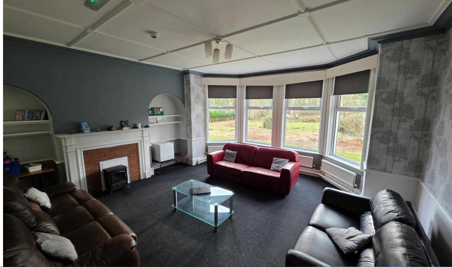
► Staff Room